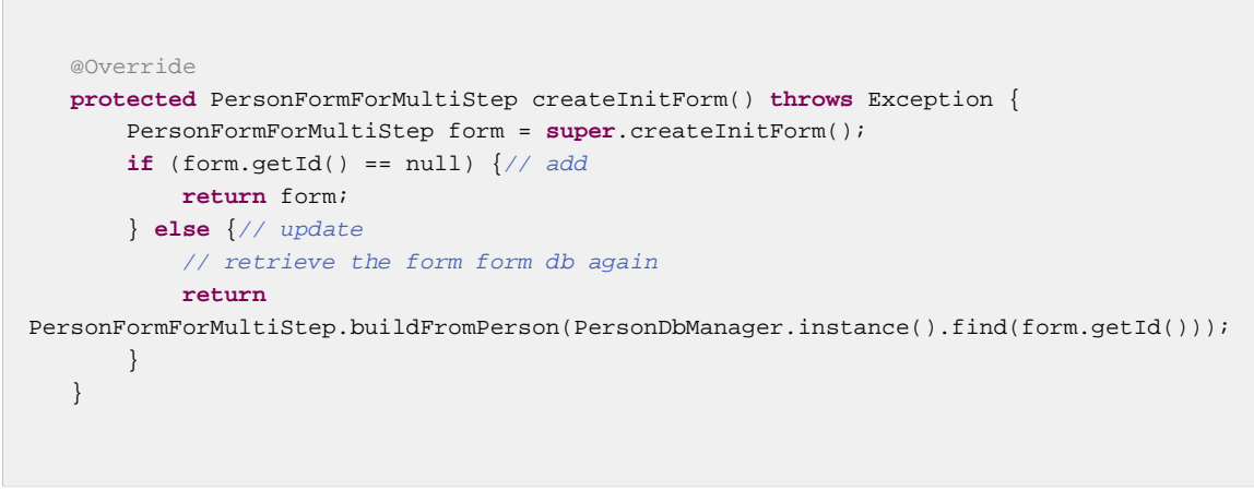
Example 8.10 query updating target data from db in createInitForm()