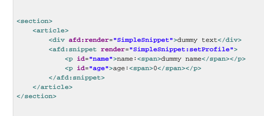
Example 3.1 Sample of snippet declaration:

· Declare snippet class in template file